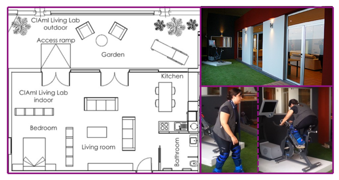
Figure 1. CIAMI Living Lab, Valencia, Spain.

The main objective of the EvAAL-AR competition is to evaluate ARS intended to be used by the elderly in real life, therefore the performance of each competing ARS is evaluated live in a living lab. The '12 and '13 EvAAL-AR competitions were held in the CIAmI Living Lab in Valencia, Spain, shown in Figure 1. There was no limitation to the number and type of devices comprising the ARS brought by the competitors. The only constraint was the compatibility with the physical limitations of the living lab.